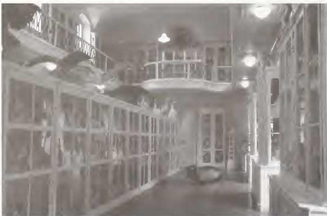
Fig. 2: Main exhibition hall of the Naturkunde-Museum Bamberg.

Altogether, Bamberg's museum holds 1,550 mounted birds of about 800 species, 75 study skins of local species, 19 complete and 12 partial skeletons, 552 eggs and 112 nests. The mounted birds are still the key specimens of the old exhibition hall (fig. 2),